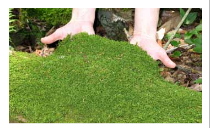
Fig. 8. Harvest loose sheet moss by using the "swipe method" or gently lifting one-foot sections with both hands. Make sure to leave one-third to one-half of the moss behind to regrow.

Do not roll up mosses (like bedrolls) because this tends to take more than half of the moss and results in very slow recovery. Do not harvest moss using rakes or other tools, which may damage the moss and their logs. Avoid cutting other plants, establishing new trails, or damaging the surrounding habitat. Gently agitate the moss (toss it lightly into the air; shaking from an edge may cause sheets to fall apart) to shake out any needles, leaves, or bugs before packing for transport.