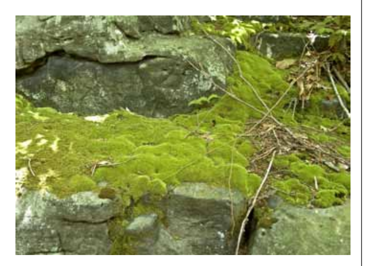
Fig. 2. Mood moss is typically found on rocks or on the forest floor.

In the eastern United States, the cool, humid conditions favoring abundant moss on logs, rocks, and the ground are most commonly found in the Appalachian Mountains (Figure 3). Permit records and direct observation have confirmed collection in Delaware, Georgia, Kentucky, Maryland, North Carolina, Ohio, Pennsylvania, Tennessee, Virginia, and West Virginia. The greatest volume of log moss is thought to come from the Appalachians of North Carolina and West Virginia.