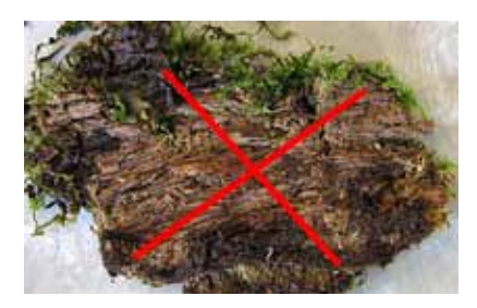
Fig. 7. Moss so firmly attached that it will not come up without chunks of log should not be taken.