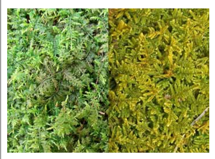
Fig. 4. The most abundant sheet mosses in this region are commonly known as delicate fern moss ( Thuidium , left) and flat fern moss ( Hypnum , right).

Because mosses rarely grow in single-species mats, many other species are affected by gathering moss and little is known about the ecology of these species. In addition to a dozen flowering plants that commonly grow intermingled with the moss, more than 70 other mosses