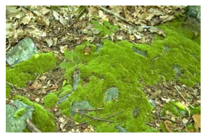
Fig. 9. Mood moss often grows in dense patches on rocks and the forest floor. Remember to leave half the moss behind to regrow.

In Pennsylvania, moss gathering is not allowed in areas set aside for recreation, protection, or research, such as parks, preserves, research areas, wilderness areas, or natural areas. The Pennsylvania Game commission also prohibits any plant removal on all of their lands. The Allegheny National Forest sells permits for moss harvest on a case-by-case basis; ask for the special forest products specialist at the local ranger's office. The Department of Conservation and Natural Resources (DCNR) regulates moss gathering according to Title 17, Chapter 21.31 of the Pennsylvania Code, which prohibits "cutting, picking,"