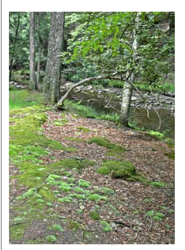
Fig. 10. Moss farming is only practical in naturally mossy areas, which can be harvested sustainably for many years by taking no more than half the moss each time and returning only every five years.

It is possible to encourage naturally mossy forests to sustainably produce moss with minimal investment (Figure 10). Besides encouraging the growth of mosses