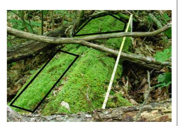
Fig. 5. Regrowth is fastest when large patches (e.g., within the black outlines) are left behind to regrow into the harvested areas, as was found with sheet moss like this in Macon County, North Carolina.

Mosses grow very slowly, between 0.25 to 2.5 inches in length annually. Recovery is slowest (approximately 20 years) when all moss is stripped from the log or rock. Recovery is fastest (approximately 10 years) when a third to a half of a sheet moss is left behind in patches (Figure 5), which then grow over the bare spots. Recovery is not possible when the log decomposes entirely, which is accelerated when mosses are so firmly attached that removing the moss also removes chunks of wood. To ensure recovery and a second or third rotation, mats should only be gathered if they are loose from the log.