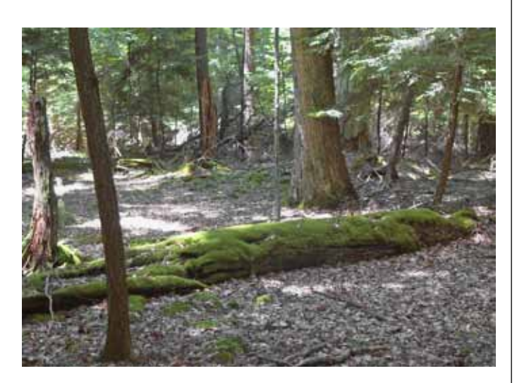
Fig. 1. Sheet moss is gathered from old logs, such as shown here, or rocks.

Collecting nontimber forest products (NTFPs) from private and public lands in Pennsylvania is a time-honored tradition that provides many with income and enjoyment. This publication explores collecting forest mosses from logs, rocks, and the forest floor. Most gathered forest mosses are known as either sheet moss—loose sheets peeled from rocks and logs (Figure 1)—or as mood moss, tight cushions collected from rocks, logs, or the forest floor (Figure 2).