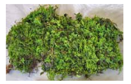
Fig. 6. Good sheet moss has a fresh, green color; flat, even appearance; and forms thin but wide sheets.

For a "moss pelt" to hang together well (for hanging on lines to air-dry), it should be around 1 foot long, at least 0.5 inch thick, and fairly dense. Moss mats on logs are roughly 0.5 inch thick, while those on rocks are generally twice as thick. Buyers will similarly pay for mood moss in relatively large, clean, whole clumps. Each clump should be a colony